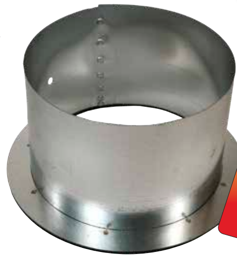
2000 Series - No Damper