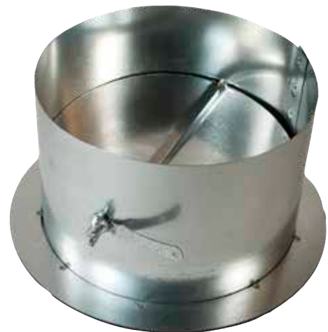
2001 Series - With Damper